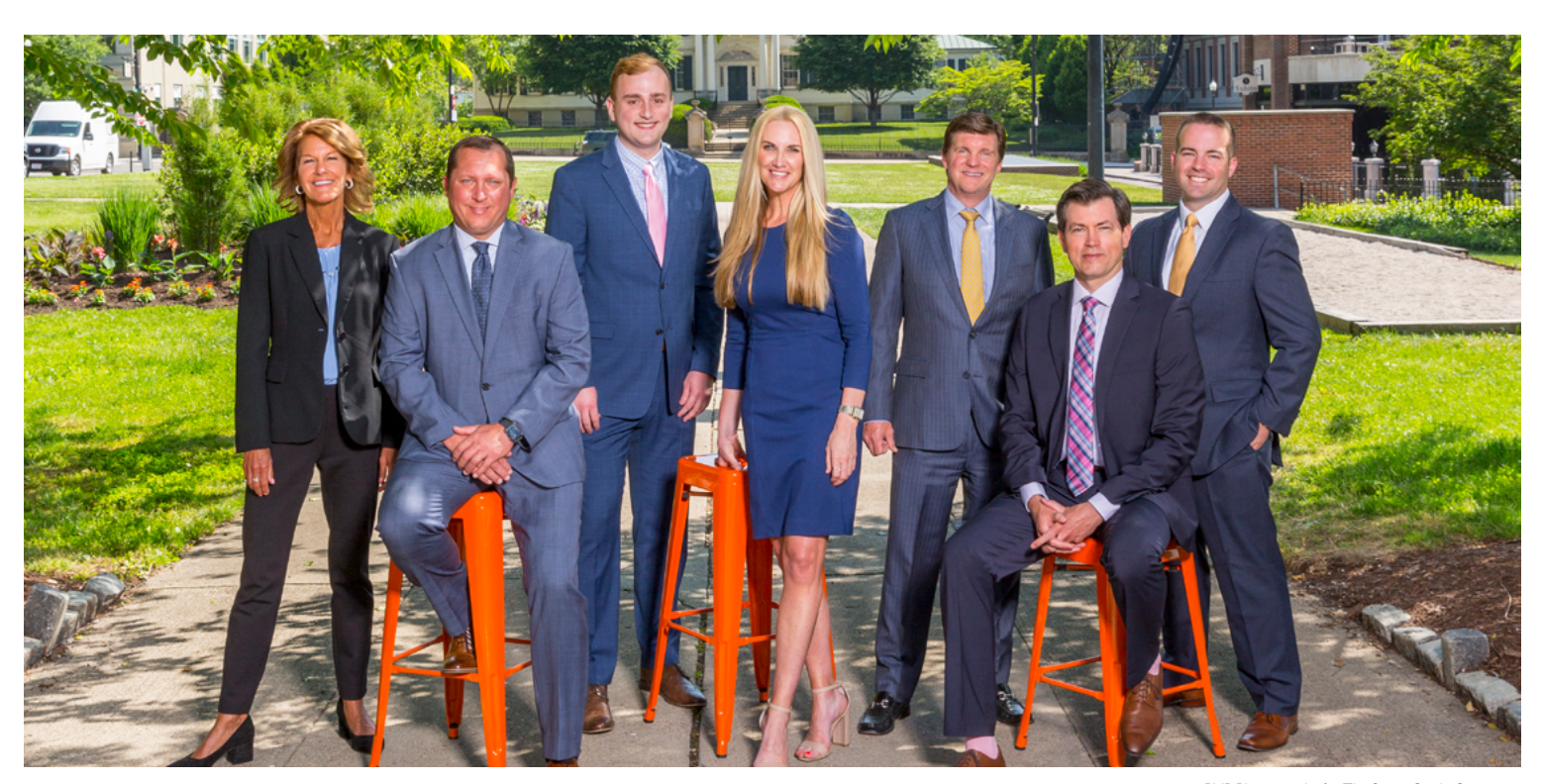
RVP Photography for The Scout Guide Cincinnati